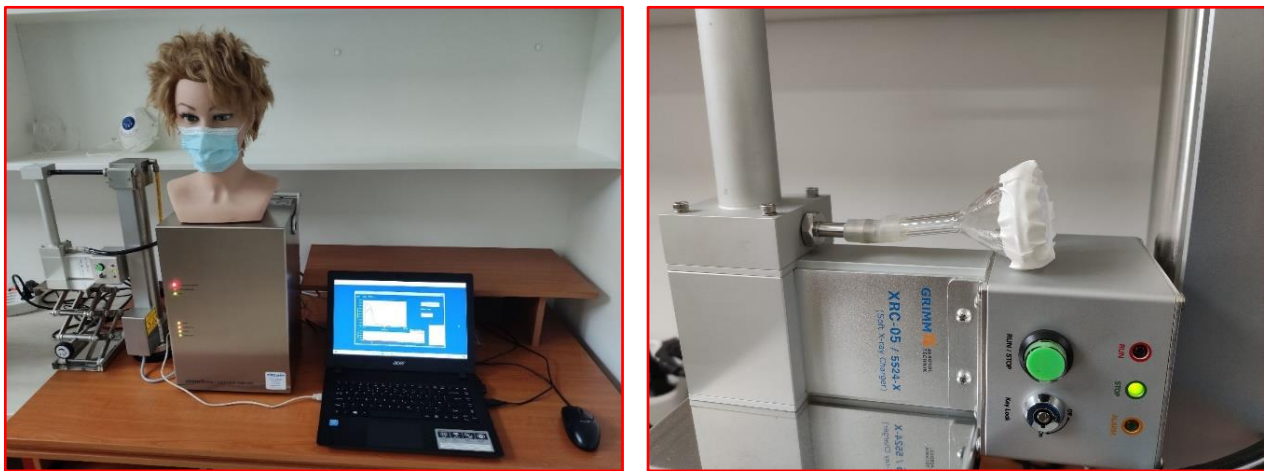
Fig. 1. Face mask test setup: the mannequin doll head and tight-fit system

More details about this system and other in-house developed components are described in [5], [6], [7] and [8]. Standard surgical face mask was tested, since it is commonly used worldwide. The tight-fit system (Fig. 1. right) was achieved by attaching the piece of mask's material to a borosilicate glass funnel using a strong duct tape.