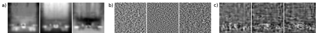
Fig. 3. First three eigenvectors derived from (a) PCA, (b) LDA, (c) Fisherfaces.

The eigenvectors calculated with PCA, LDA and Fisherfaces can be seen in Fig. 3. The first three components, derived from the respective dimensional reduction methods are shown here and can also be interpreted as the extracted features. As it can be observed, the features of the truck are easily distinguished in the first three principal components (see Fig. 3a). On the other hand, the features from LDA are very noisy (see Fig. 3b). Fisherfaces also show noisy images, however, the contours of the truck are still recognizable (see Fig. 3c).