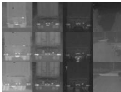
Fig. 1. Training datasets (from left to right column: pos_1 , pos_2 , pos_3 , neg ).

In the object detection system that is developed in the RelCon project the rear end of a truck is to be detected within a thermal infra-red image of the size 320 \times 240 pixels. For training purposes a dataset of 6,682 positive training images, which depict the truck in different thermal conditions and environments, and 5,295 negative training images, showing the trucks background scenery, are available. All training images have the size: 50 \times 50 pixels. The positive training images are segmented in three separate datasets representing different hours of the day and thermal conditions, henceforth referred to as pos_1 , pos_2 and pos_3 . The complete negative dataset will be referred to as neg in the rest of this paper. Fig. 1 shows a sample of these datasets in their original resolution.