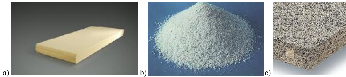
Fig. 3. (a) Polyurethane; (b) Expanded perlite; (c) Wood wool.

Wood wool is produced so that the fibers are combined with cement. Panels are lightweight because they contain cavities. For thermal insulation a mixture of wood particles and a binder can be used.