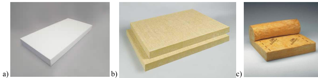
Fig. 1. (a) Styrofoam; (b) Stone wool; (c) Glass wool.

Glass wool is among better materials for insulation. The main raw material used to produce glass wool is quartz sand with the addition of recycled glass. Stone wool has a lower density than rock wool and lower compressive strength, while the insulating properties are approximated to rock wool.