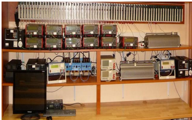
Fig. 2. VML server and devices table

At the beginning when client starts to work in VLM, he/she connects to the server and asks server for available devices. Server sends a set of devices connected to devices table to the client. A database of server may contain a number of devices possibly connected to the devices table. However, not all the available devices are connected once at the time. Server and parts of devices table are shown on Fig 2.