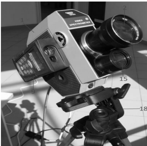
Fig. 3. View of emission video spectrometer made at the University Suceava. 1-body of video spectrometer, 2-collimating lens, 9-laser telemeter, 15-video camera, 18-tripod

Solving this problem out was possible due to the suggestions made by the authors in conceiving and carrying out the spectrometer hereby shown. According to these solutions, the control of spectra acquisition is made only for maximum emission intensities and for very short periods of time of milliseconds, in the end a single spectrum, for a measuring point, results which is the spectral average of tens of spectra acquired. Since maximum emission intensities give maximum photocurrents at Diode Array detector, to sense these ones and control spectrum acquisition, we used the moment when the result of I derivate of photocurrents' sum (determined by the integration of photocurrents' sum \sum I_f given by Diode- Array detector and time t has the value zero: