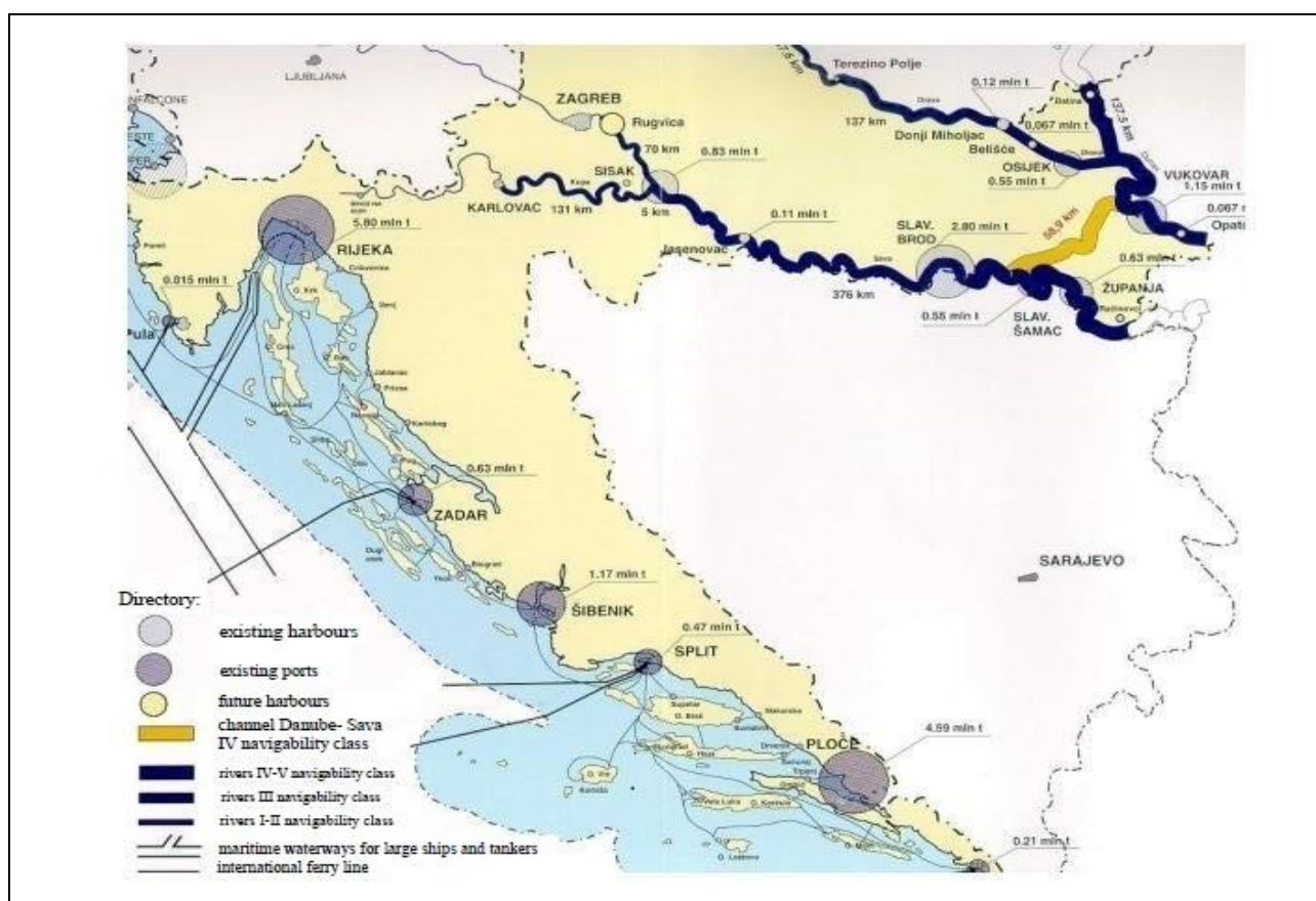
Fig 5. Croatian inland waterways

The establishment of a new river-rail connection between the Danube Region and the Adriatic, i. e. between the Port of Rijeka and Vukovar, implies the construction of the Danube - Sava Multipurpose Canal, the reconfiguration of the river Sava routes from Slavonski Brod to Vukovar and Slavonski Samac - Sisak in order to achieve navigability class IV, and the construction of the new Rijeka - Zagreb high-efficiency railway. The Croatian inland water routes belong to the VII Danube Corridor (Dundovic & Vilke, 2009).