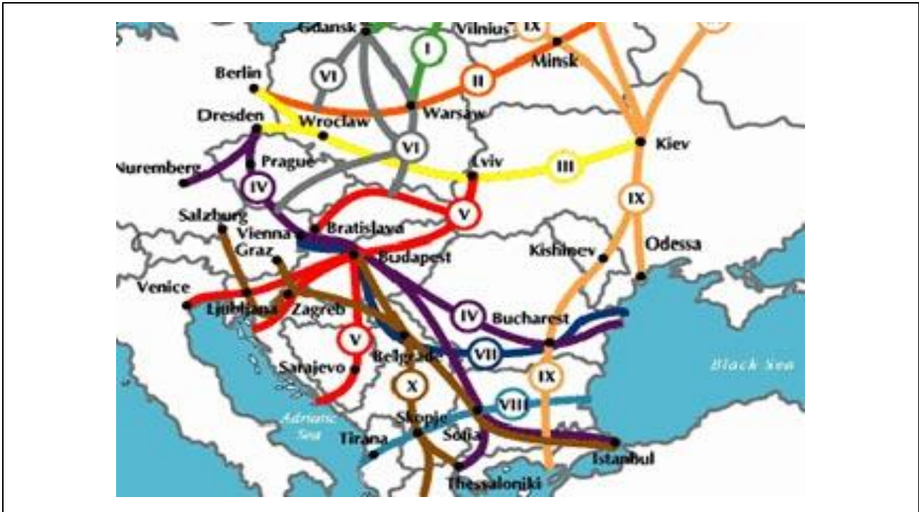
Fig. 1. Pan-European corridors that pass through Republic of Croatia

All of these investments render the possibility of full utilization of intermodal transport in the Republic of Croatia, thereby exploiting the advantages of its favourable geo-traffic position.