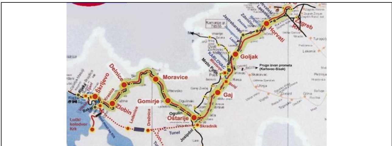
Fig. 4. Lowland railway Zagreb-Rijeka

The comparative advantage of railways, in combination with river modes renders: