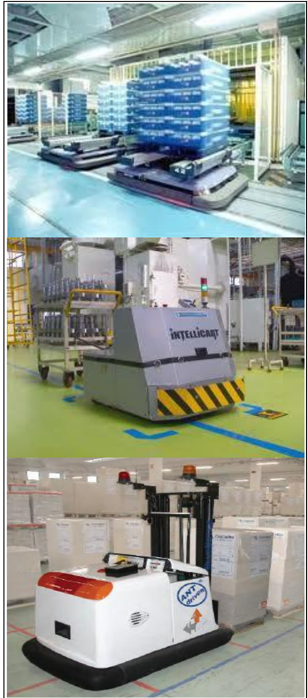
Fig. 5. Floor transport – “FLEXILANE”

turning point in the operation and in the reduction of costs, thus making these devices profitable