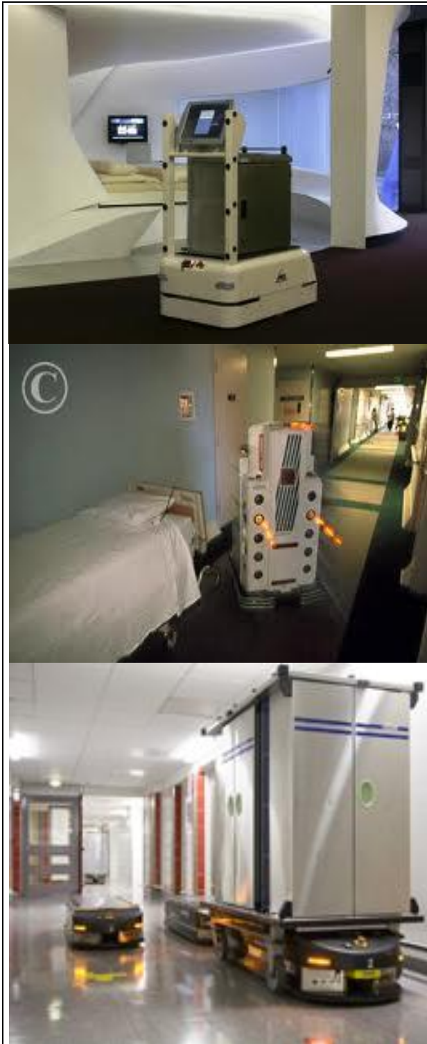
Fig. 4. Automated – AGV – vehicle for transport of materials in hospitals, Courier robot of type “Helpmat”, TransCar LTC of Swisslog

the floor across which the transport and material lifting is performed, such as e.g. boxes, pallets, and other things that are placed into the container. In the meantime, free AGV navigation is used to the greatest extent for the logistics in production.