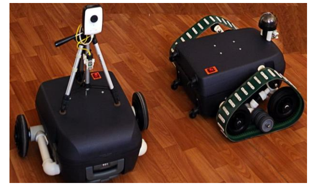
Fig. 2. Robots "AMUR" for education

more than 9000km) the operator, directed in conformity with the received videos and data from locator sensors, was not able follow strictly to given trajectories. Environment to information, sent by robot, was received at control desk with different delays, some frame were lost in video-flow. Also in some cases connection between robot and supervise was fully lost during execution of necessary works, for example, within riding into enclosed space. The some situation was during work with special purpose robots BROKK-110D/BROKK-330 (Pist.3) within transferring video-flows from the place of work and commands of PTZ- (pan, tilt, and zoom) control over TVcameras through Wi-Fi net at the borders of signal. So the supervisor control in real-time mode in conditions of significant delays and within unstable and unguaranteed delivery of data packs could not be usually provided.